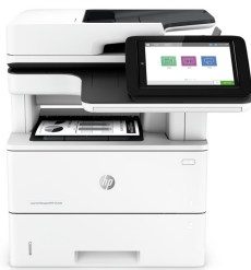
HP LaserJet Managed MFP E52645dn

Choose an HP LaserJet Enterprise MFP designed to handle business solutions securely and efficiently, and helps conserve energy with HP JetIntelligence toner. Keep up with the demands of growing business with a printer you can rely on.