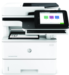
HP LaserJet Managed Flow MFP E52645c