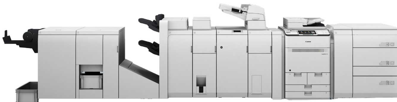
Typical applications of the imagePRESS C270 Series.